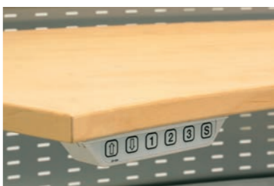
Möjlighet till tre favorithöjder. Three favourite heights.