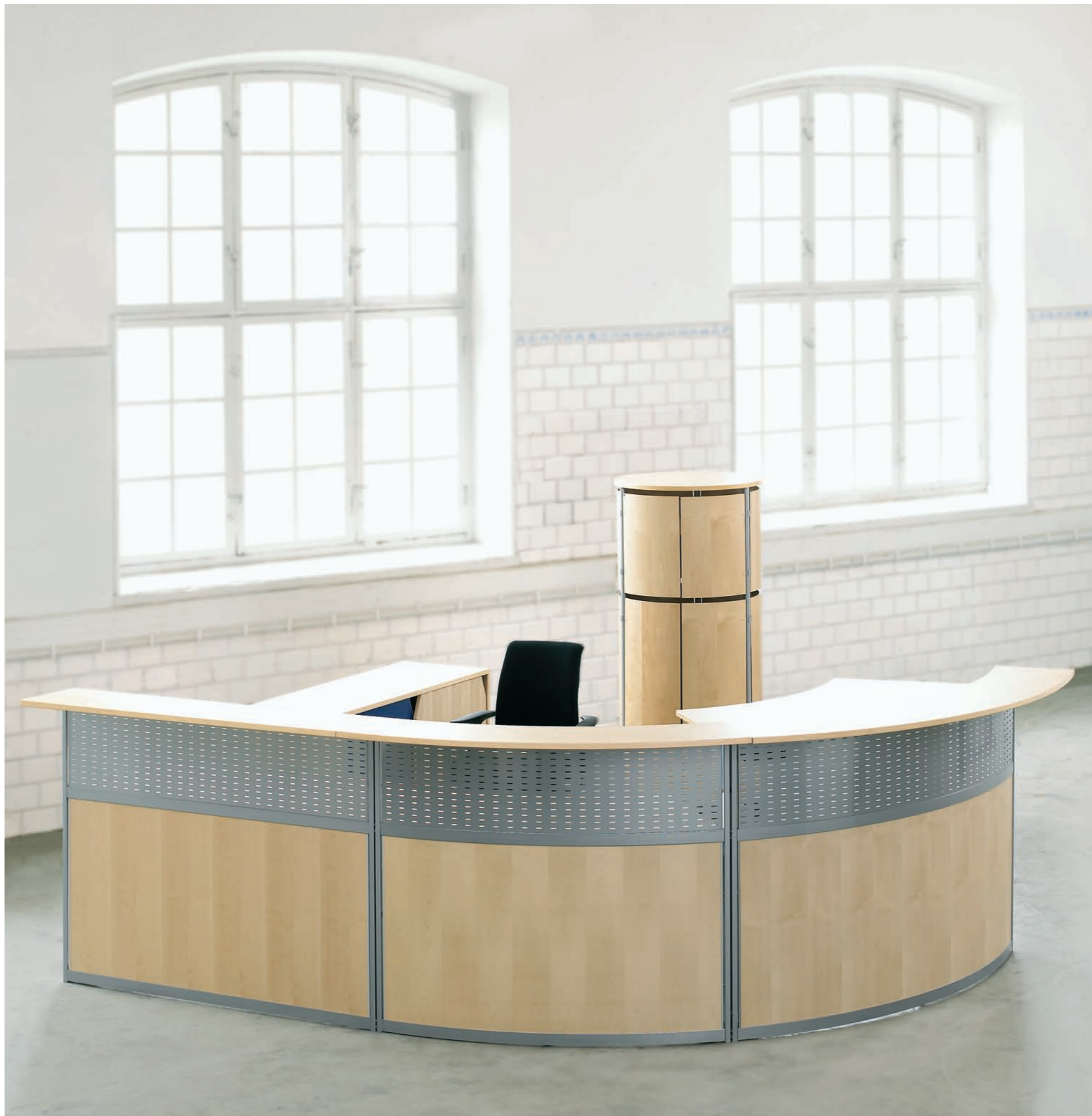
Front i björk samt silverlackerad plåt. Högt pelarskåp i björk. Front in birch and powdercoated metal in silver. Round cabinet in birch.