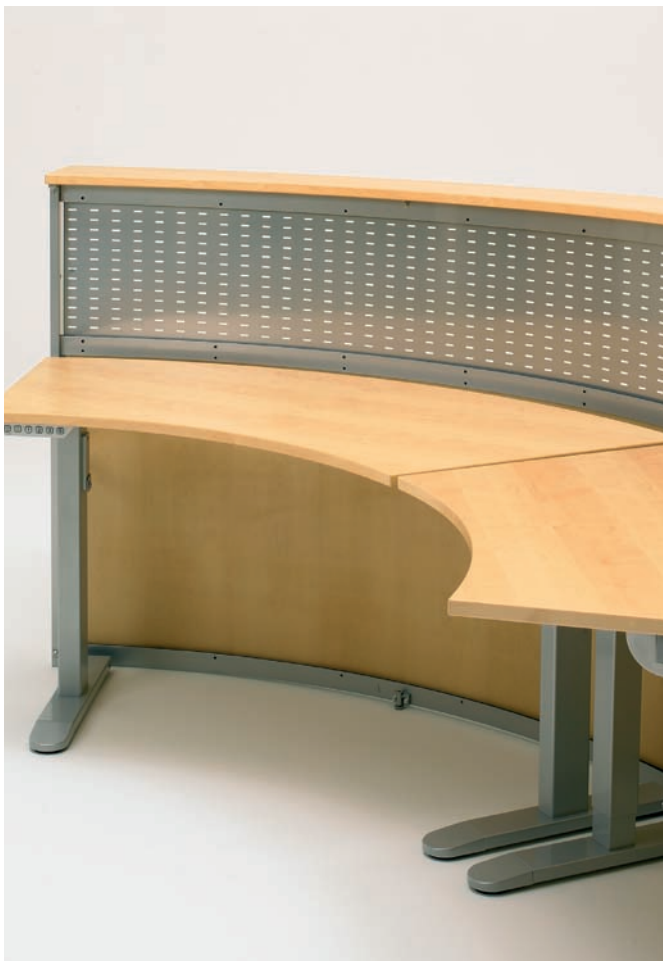
Elarbetsbord i sittläge. Electric height-adjustable desk in low position.