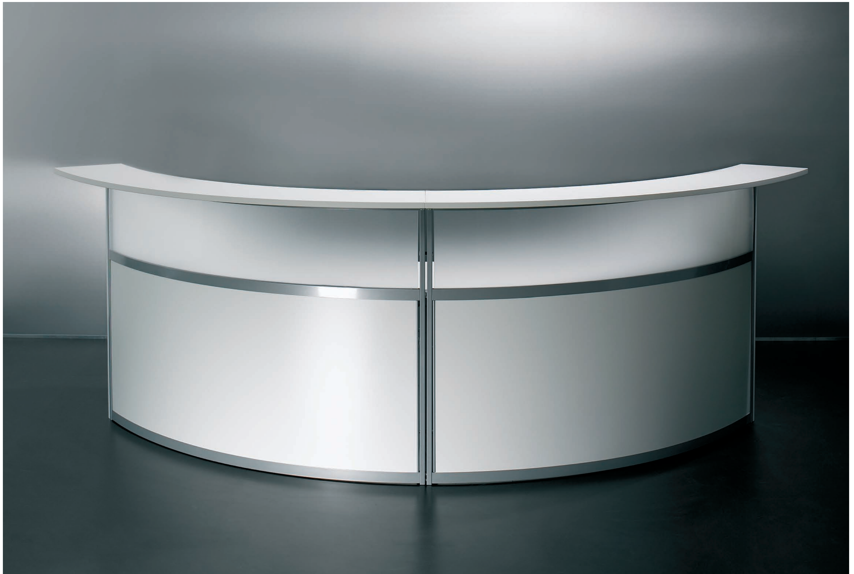
Snitsa reception i vit laminat samt frostat plexiglas. Snitsa reception in white laminate and frosted acrylic glass.