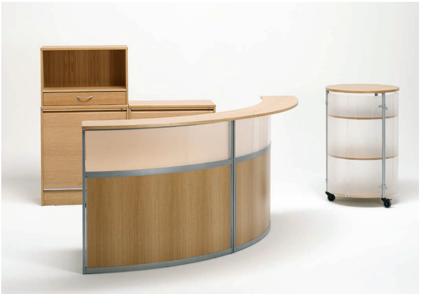
Front i ek samt frostat plexiglas. Lågt pelarskåp i plexi. Front in oak and frosted acrylic glass. Round cabinet in acrylic glass.