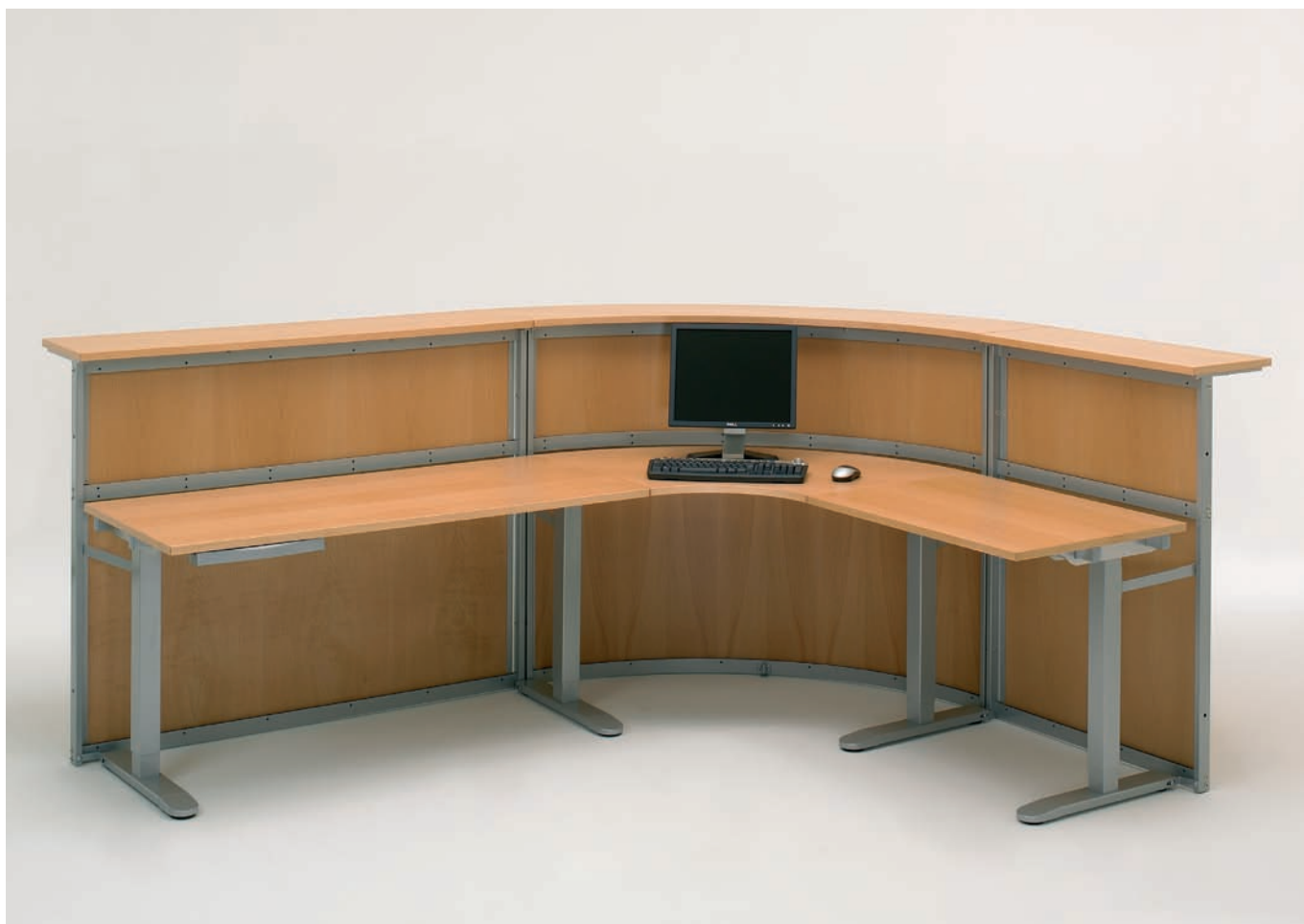
Insida med gott om plats. Inner side with plenty of space.