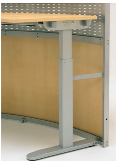
Ben med elektriskt ställbar höjd. Leg with electric height adjustment.