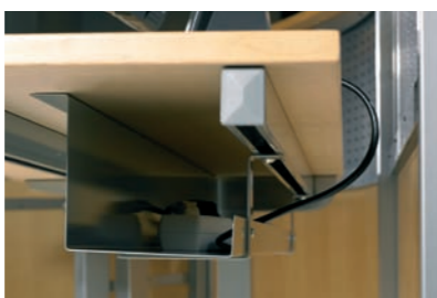
Rymlig kabelränna. Cable trough with plenty of room.