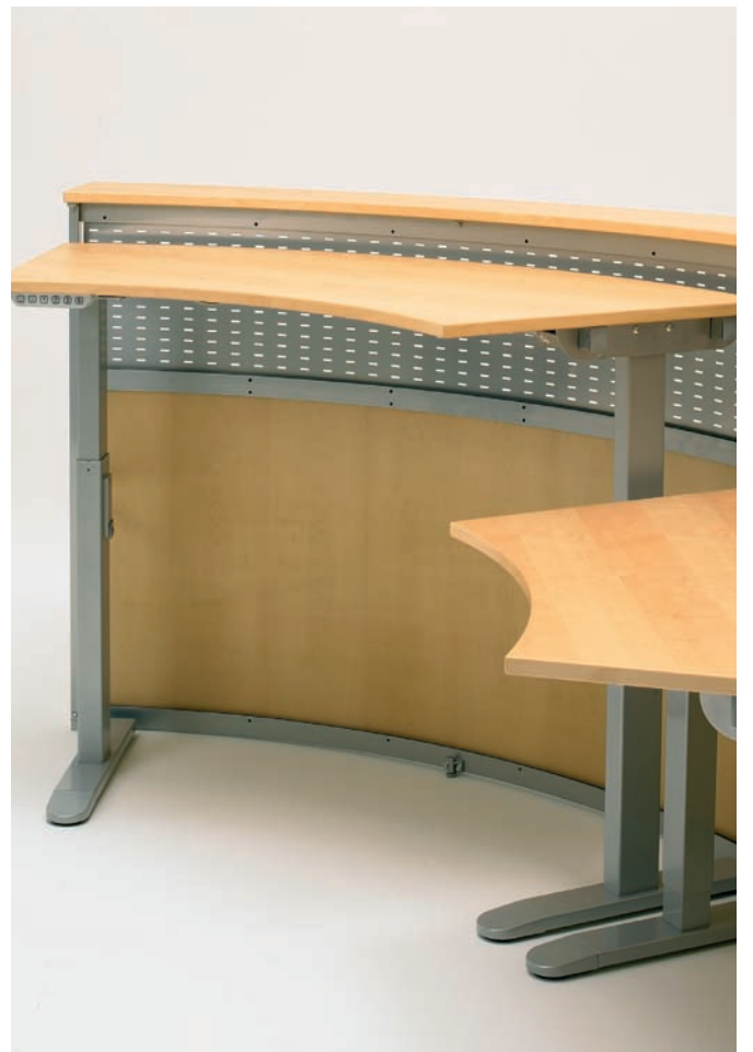
Elarbetsbord i ståläge. Electric height-adjustable desk in high position.