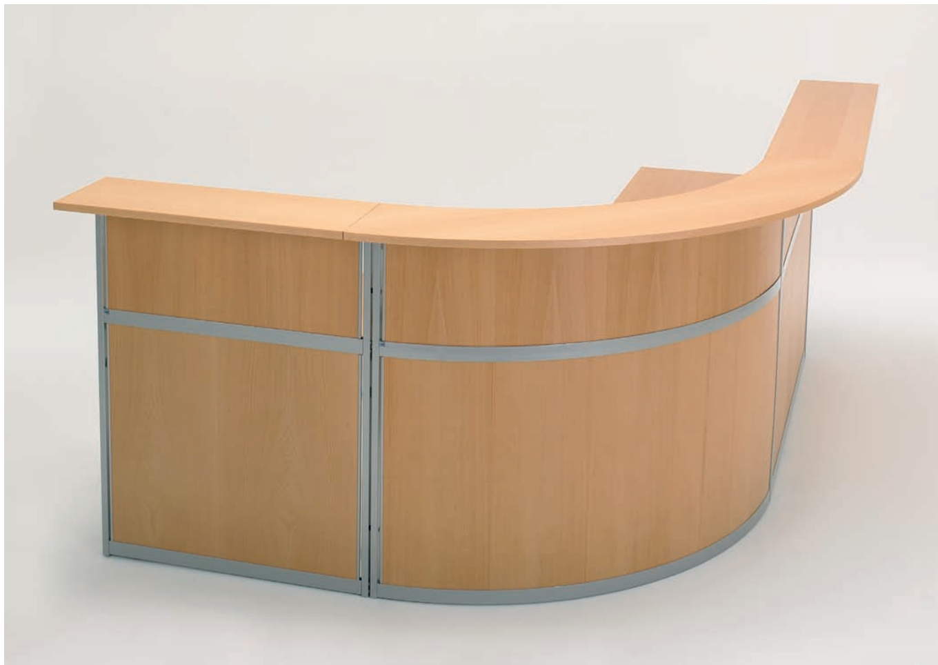
Front helt i bok. Front entirely in beech.