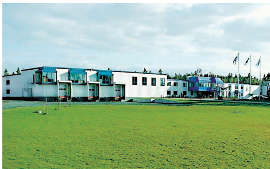
Tillverkning sedan 1896 Manufacturing since 1896

SA Möbler AB Kyrkefallavägen 3 SE-543 34 Tibro, Sweden