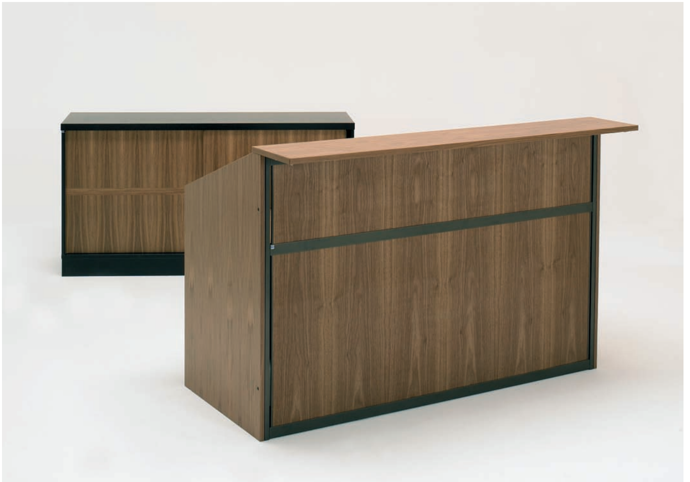
Rak del i valnöt. Snitsa XL-skåp. Straight section in walnut. Snitsa XL cabinet.