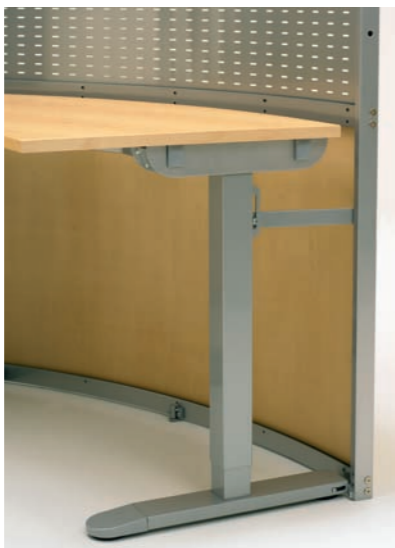
Ben med manuellt ställbar höjd. Leg with manual height adjustment.